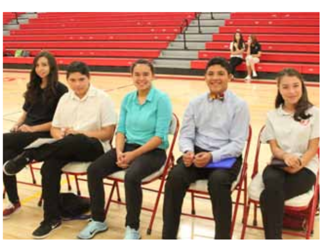
Left to Right: Seniors that set-up for Freshmen Mixer ASB officers as tour guides. Drama Club at the club sign-up event The Freshmen Mixer The new Freshmen class officers.