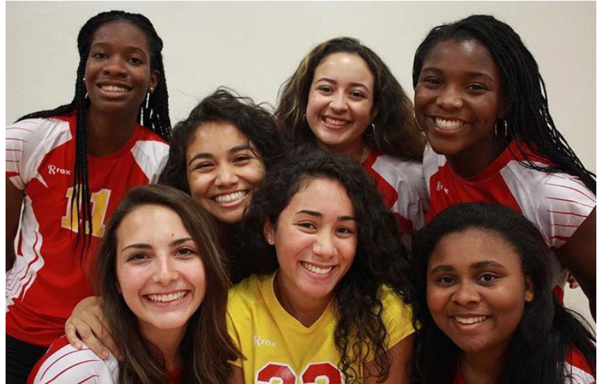
Girls’ Volleyball